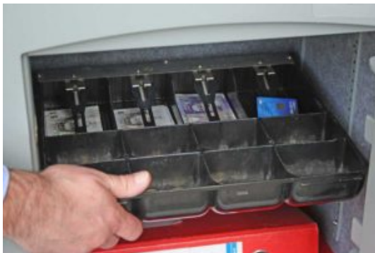
Mini Vault 3 & Till Draw