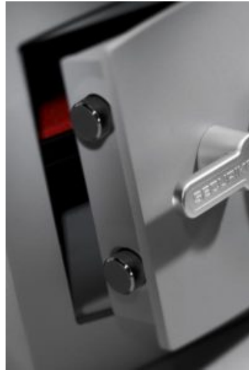
Mini Vault Bolts & Handle