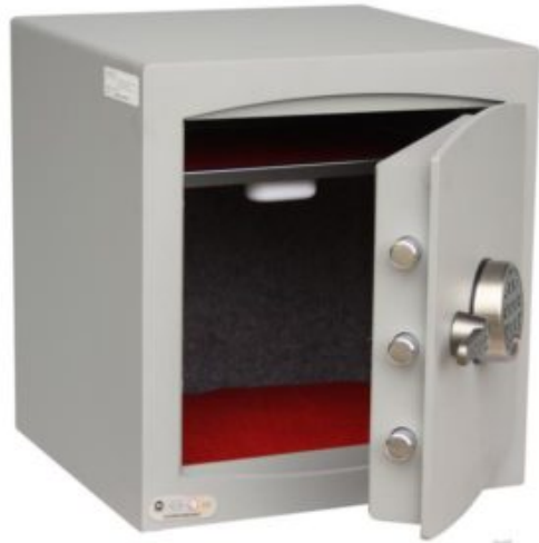
Mini Vault 3 S2 Silver Electronic Locking