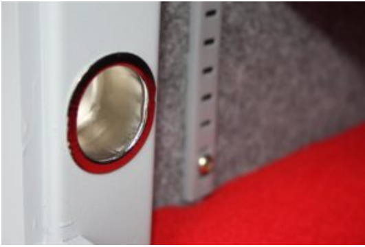
Mini Vault Chrome Bolt Cup