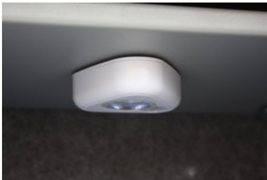
Motion Activated Magnetic Light