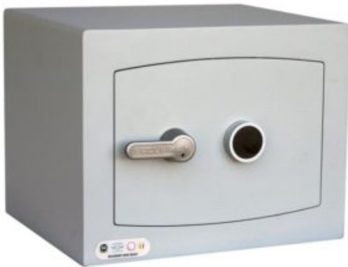
Mini Vault 1 S2 Silver Key Locking