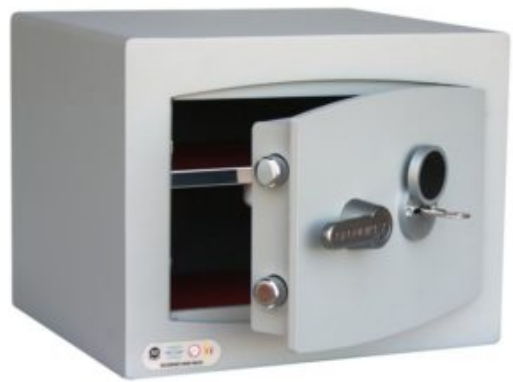
Mini Vault 1 S2 Silver Key Locking