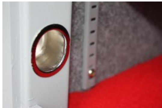
Mini Vault Chrome Bolt Cup