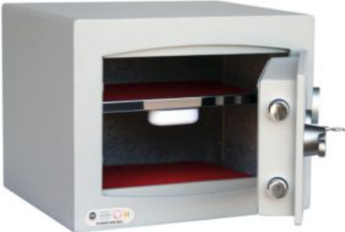
Mini Vault 1 S2 Silver Key Locking